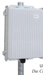
UPSPro™ Die Cast Enclosure