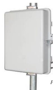
UPSPro™ Polycarbonate Enclosure