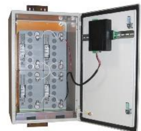
RemotePro™ ST Series