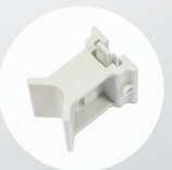
Pole mounting bracket