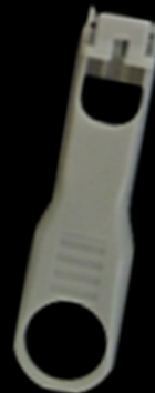
ARC-AF-F6C-K Locking Boot Key